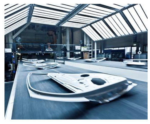
Fig. 3: Serial Press Line

energy efficiency and reduce CO<sub>2</sub> emissions even for lower-cost vehicles. LoCoMaTech can contribute substantially towards helping vehicle manufacturers to meet the increasingly stringent European Union regulations concerning our environment and responsible energy usage.