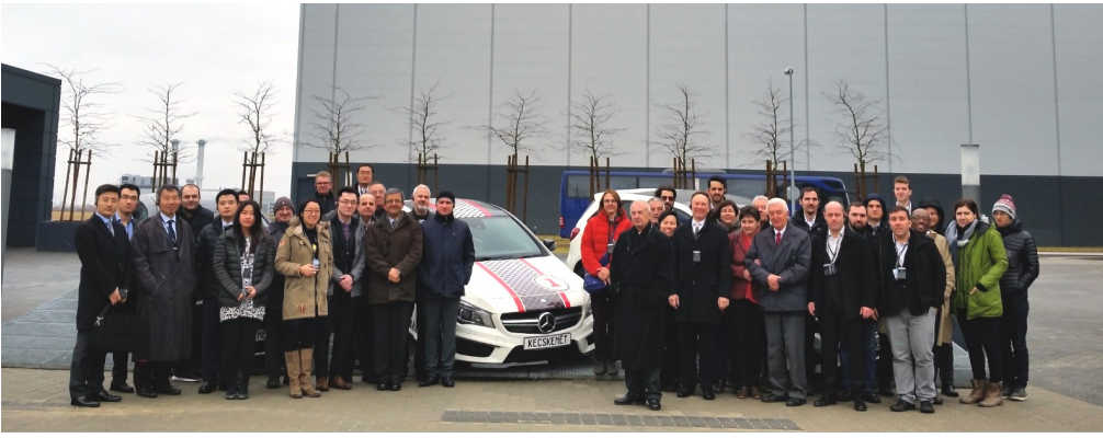
Fig. 4: LoCoMaTech Consortium @ Mercedes-Benz Plant in Kecskemét

An Industrial Advisory Board will overview the work carried out by the partners; members are Mercedes-Benz Manufacturing Hungary and Process&Product.